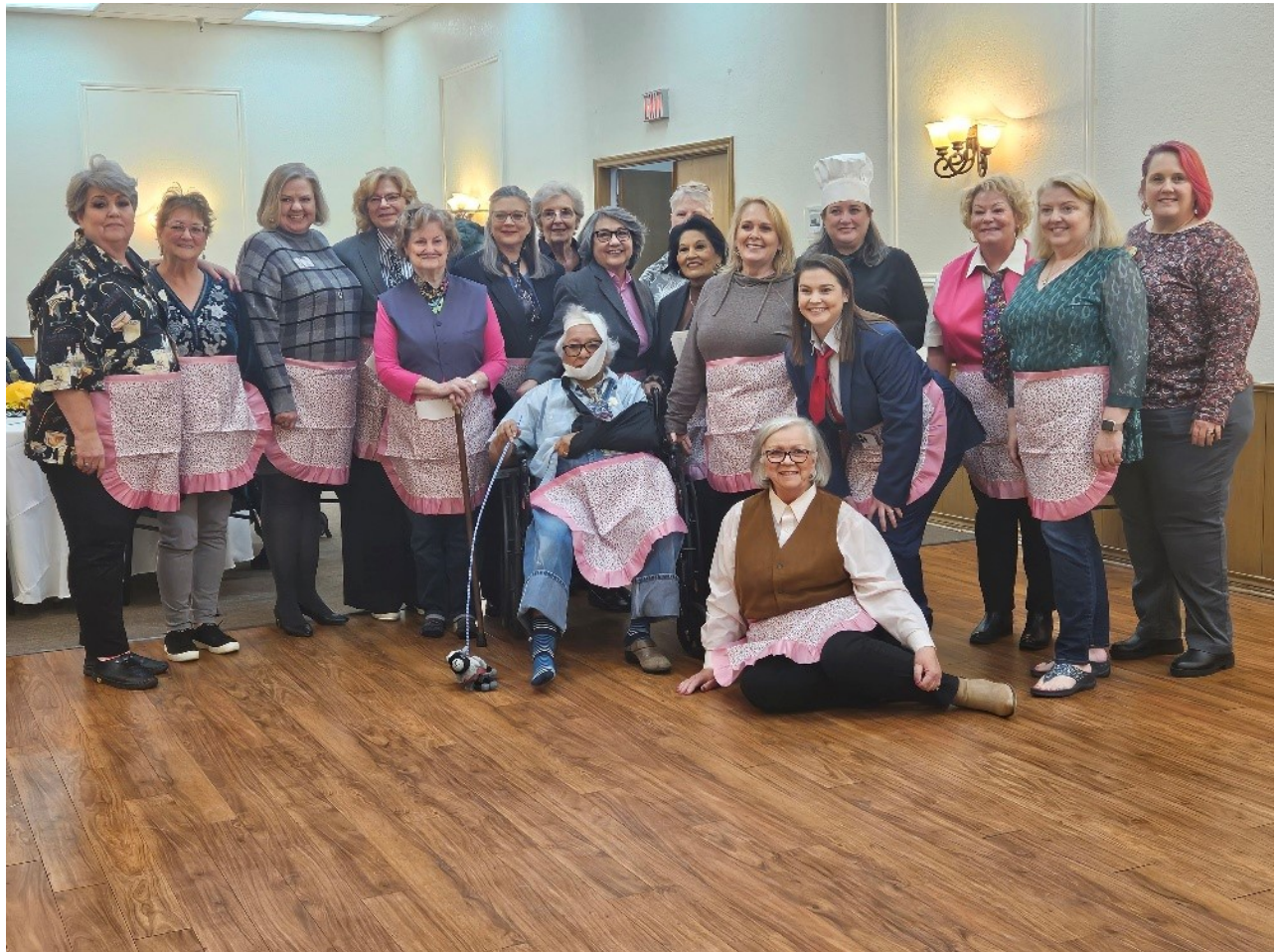
“Pink Lodge” Skit Cast and Guests Great job everyone!!