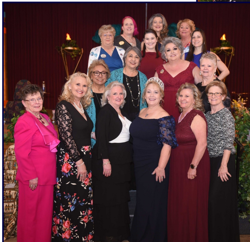
2023/2024 Shalman Temple Officers