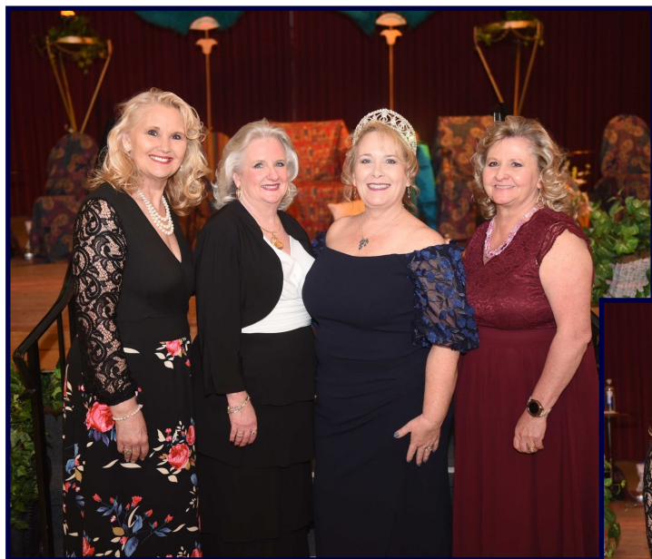
2023/2024 Shalman Line Officers