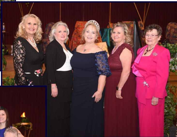
2023/2024 Shalman Elected Officers