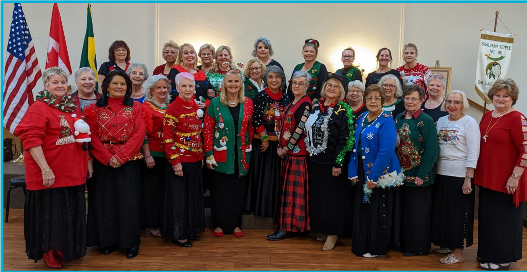
Ugly Christmas Sweaters at Session