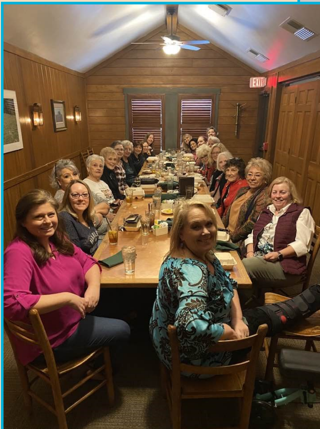
Pageantry Holiday luncheon