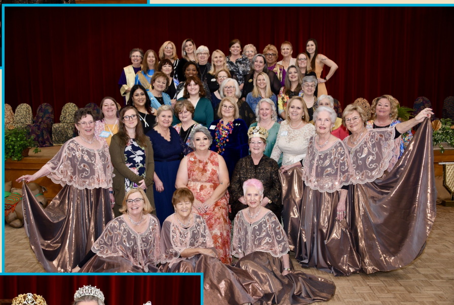
Shalman Temple No. 90 Everyone!