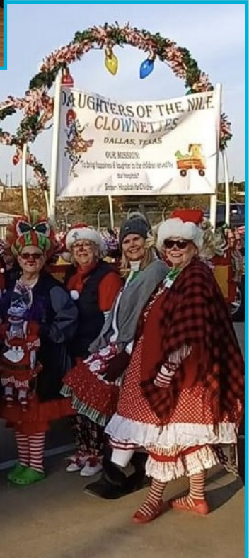
Clownettes at the Rockwall Christmas Parade