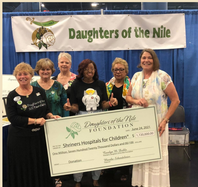
Foundation check to be presented to Shriners Hospitals for Children