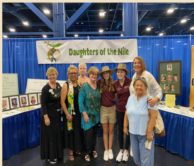
Daughters of the Nile and DON Foundation Booth workers with Shrine Ambassadors