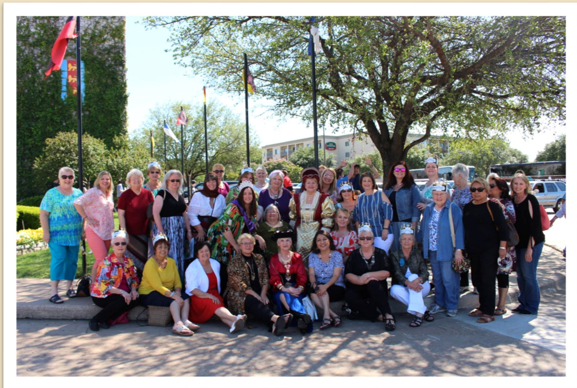
Shalman Temple No. 90 Ladies at Medieval Times