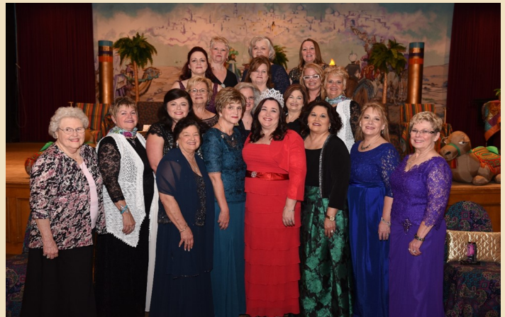
Shalman Temple Elected and Appointed Officers